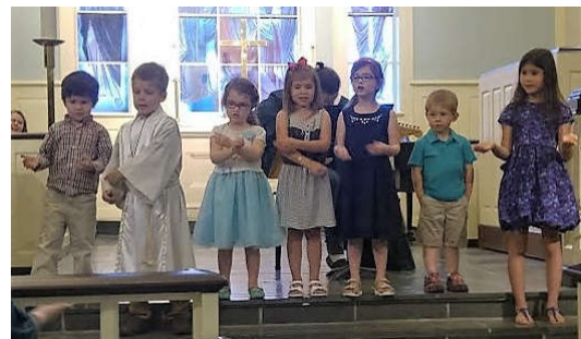
The Children's Choir sang, Lord, I Lift Your Name on High .