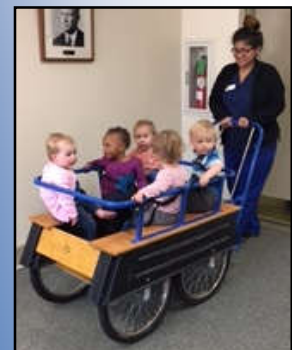
The Learning Center toddlers in their buggy.

If your birthday isn't included in our list, please contact the church office (405-842-1486) to be added.