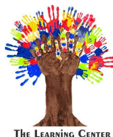
THE LEARNING CENTER