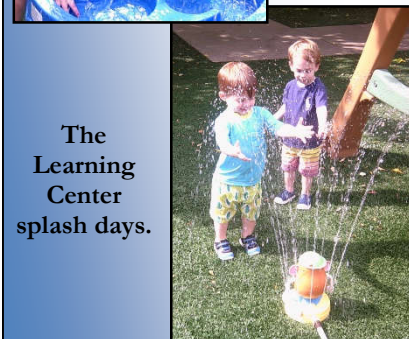
The Learning Center splash days.